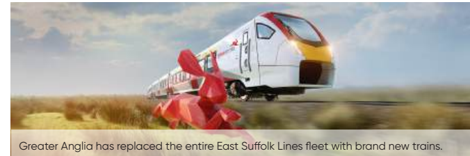
Greater Anglia has replaced the entire East Suffolk Lines fleet with brand new trains.

Whilst every care has been taken in the production of this timetable, Greater Anglia can not be held liable for any errors or omissions contained within.